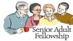
Senior Adult Fellowship

For further information, please contact (416)917-8024