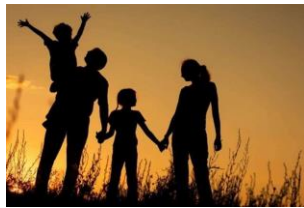
The Summary of the Post-Synodal Apostolic Exhortation Amoris Laetitia (The Joy of Love) by Pope Francis