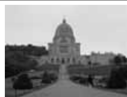
St. Joseph's Oratory - Montreal

Seemingly, his first healing occurred while supervising the children in the infirmary of the college. He sent a kid, having fever, to play outside. The kid obeyed and went to play. Brother Andre did not get disciplined because, miraculously, the fever of that child ceased. Soon he was seeing many sick people, physically or spiritually, in his small office in the college and later, when the number of people increased, in the tram shelter across the college. He was seeing a person for 2-3 minutes, recommending them in prayer to St. Joseph, or anointing them with "St. Joseph" oil, taken from the lamp burning in front of St. Joseph's altar in the college chapel, or offering them a St. Joseph medal. He had a special devotion to St. Joseph. Brother Andre credited God through the intercession of St. Joseph for all healings. Thousands of people claimed they were cured by the Miracle Worker of Montreal.