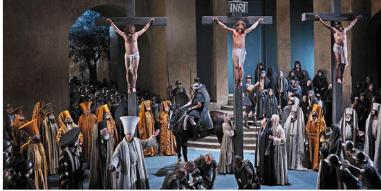
The Passion Play in Oberammergau - Germany is performed every 10 years!

Under spiritual leadership of Fr. Gigi Philip, Pastor, August 24 – September 5, 2020 – 13 days $ 5,290.00 (Toronto Dep., Incl all taxes & tips)