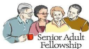
Senior Adult Fellowship

This fellowship will be held every 1 st and 3 rd Friday of the month from 9:15 - 11:00 pm after mass and adoration at 8:30 am.