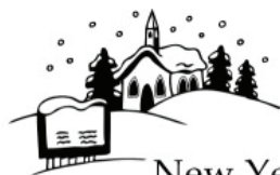
New Year's Mass Schedule